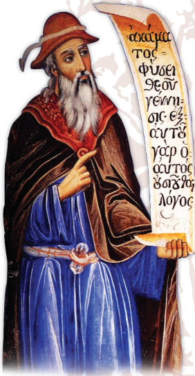
The wise Aristotle - wall painting on the portico of the entrance to the Ministry of Votsped (1808)